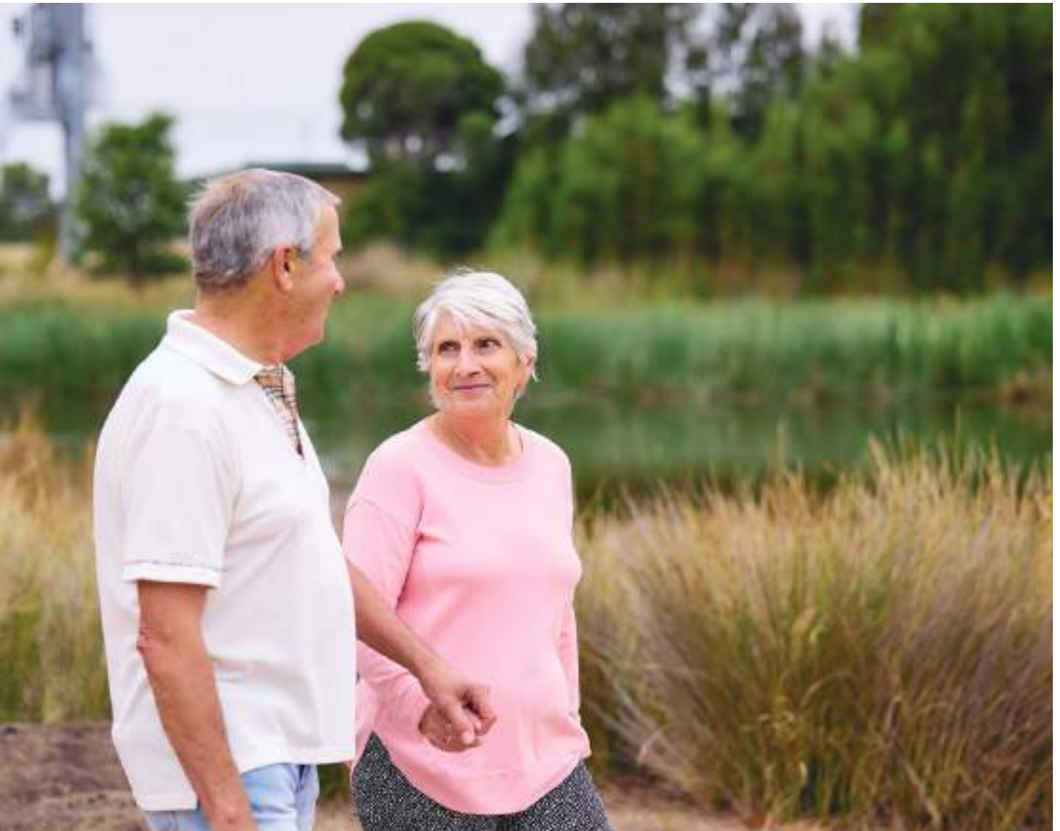
Bridgewater Lake residents enjoying a walk around the lake

The gardens and landscaped outdoor spaces are the true heart of Bridgewater Lake. More than just an aesthetic feature, these carefully designed green spaces promote well-being, relaxation, and a strong connection with nature.