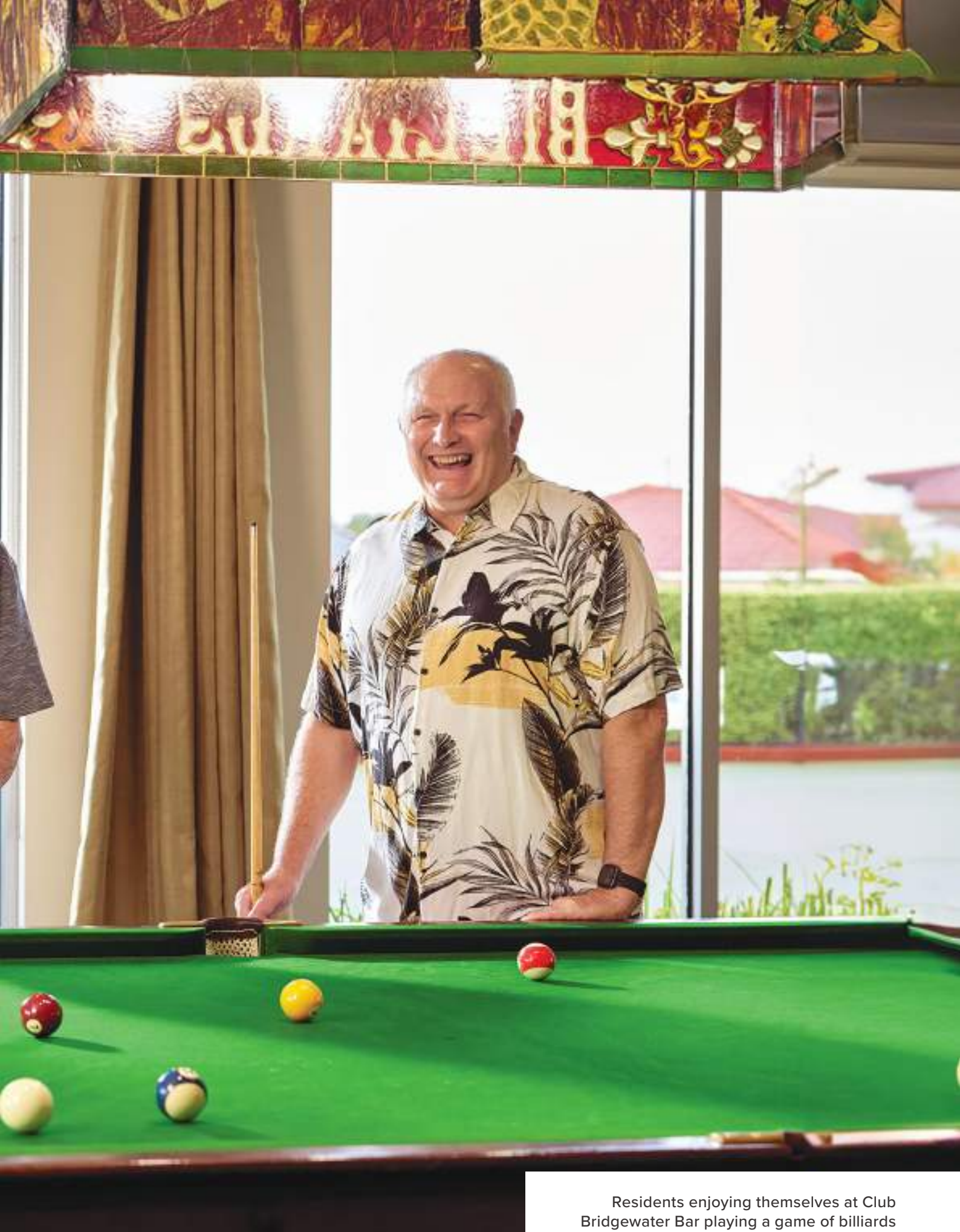
Residents enjoying themselves at Club Bridgewater Bar playing a game of billiards