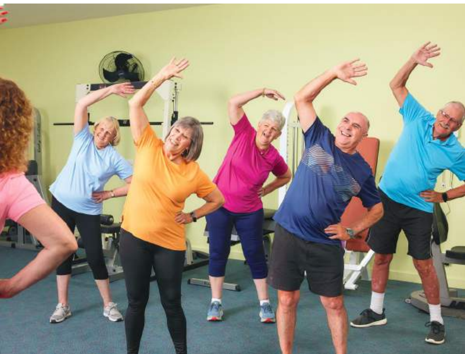
Bridgewater Lake residents enjoying a gym class

Our Gym & Wellness Centre offers a comfortable and well-equipped space for residents to maintain their health and fitness in a way that suits their needs and abilities.