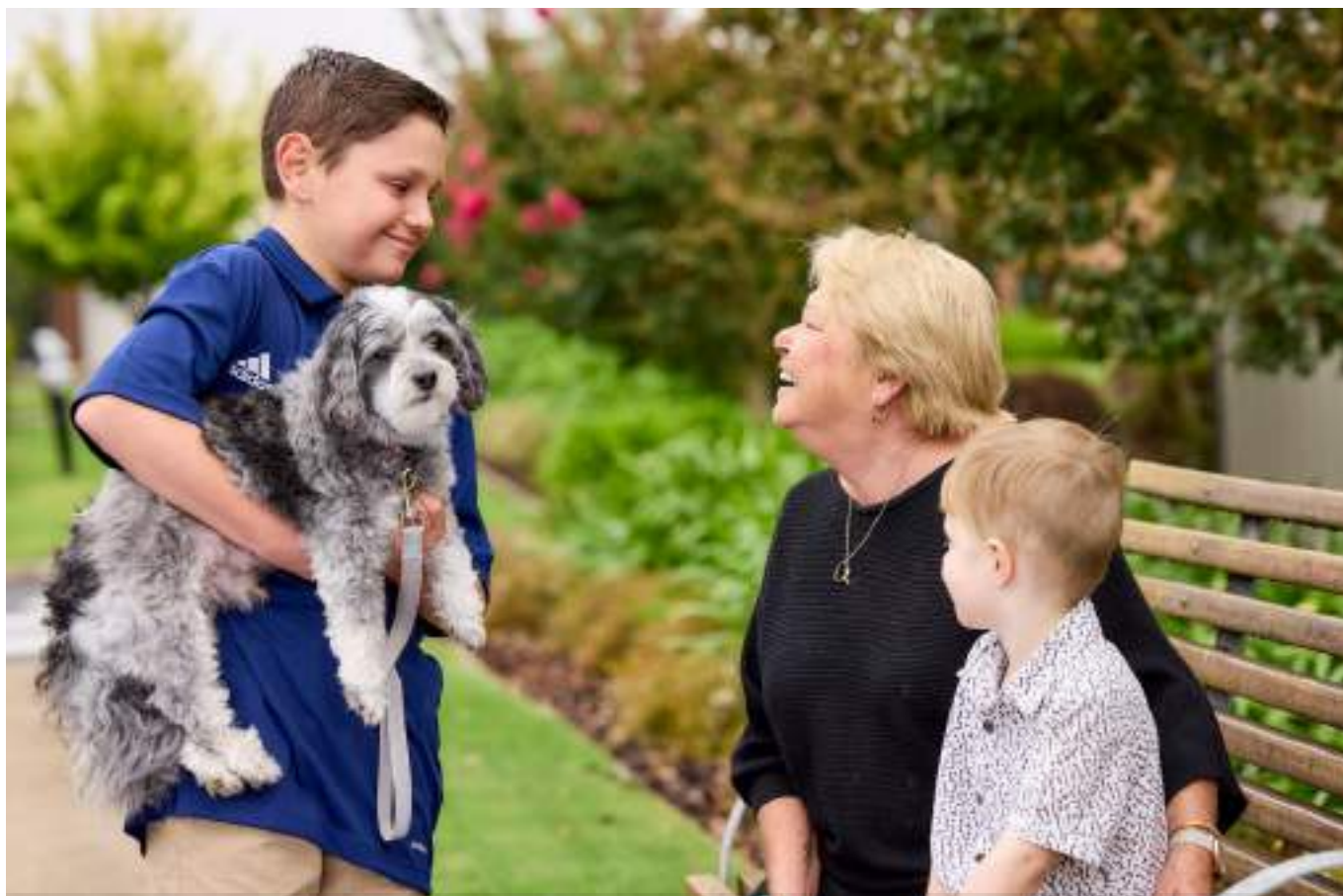
Bridgewater Lake resident enjoying time in the communal gardens with her grandchildren