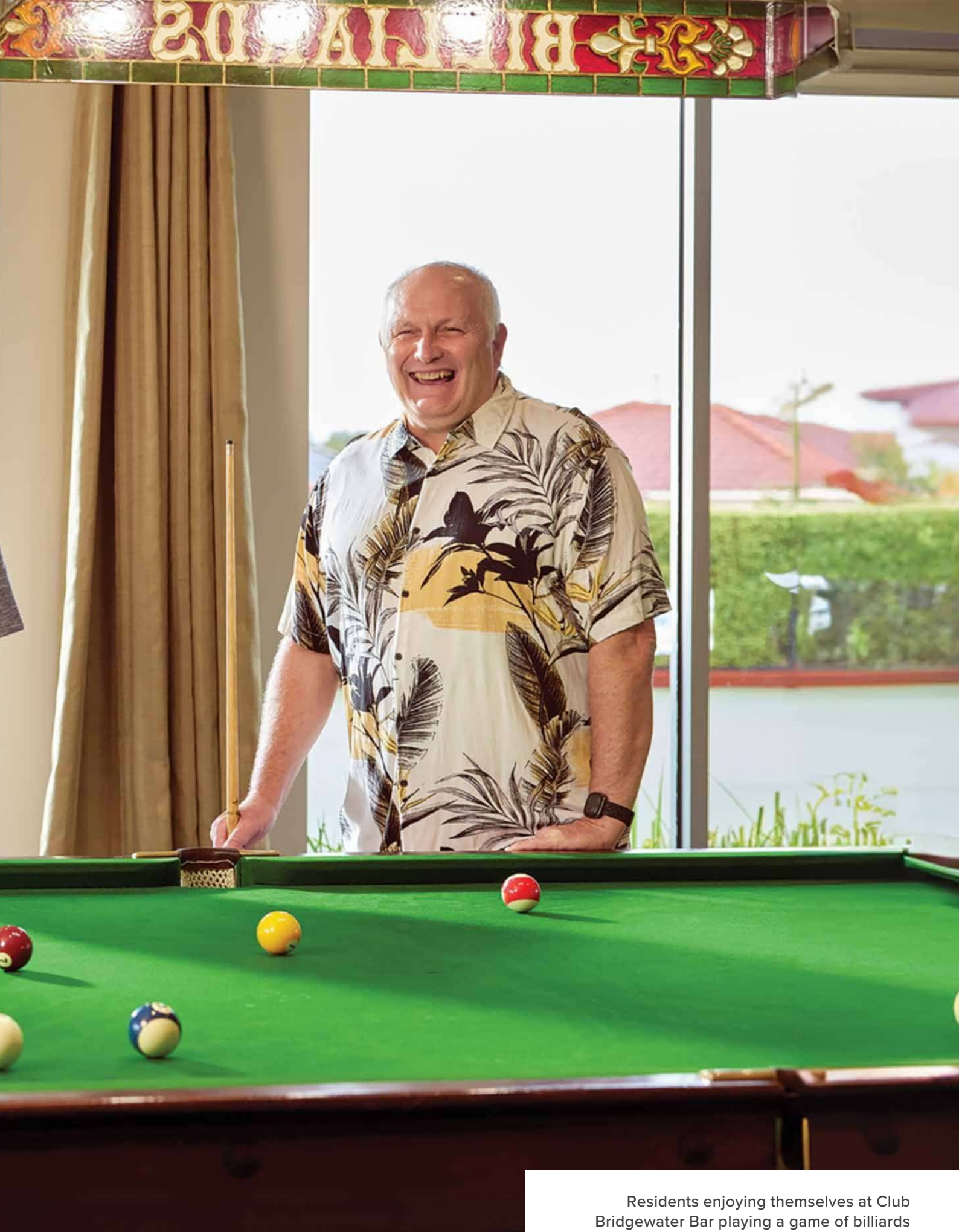
Residents enjoying themselves at Club Bridgewater Bar playing a game of billiards