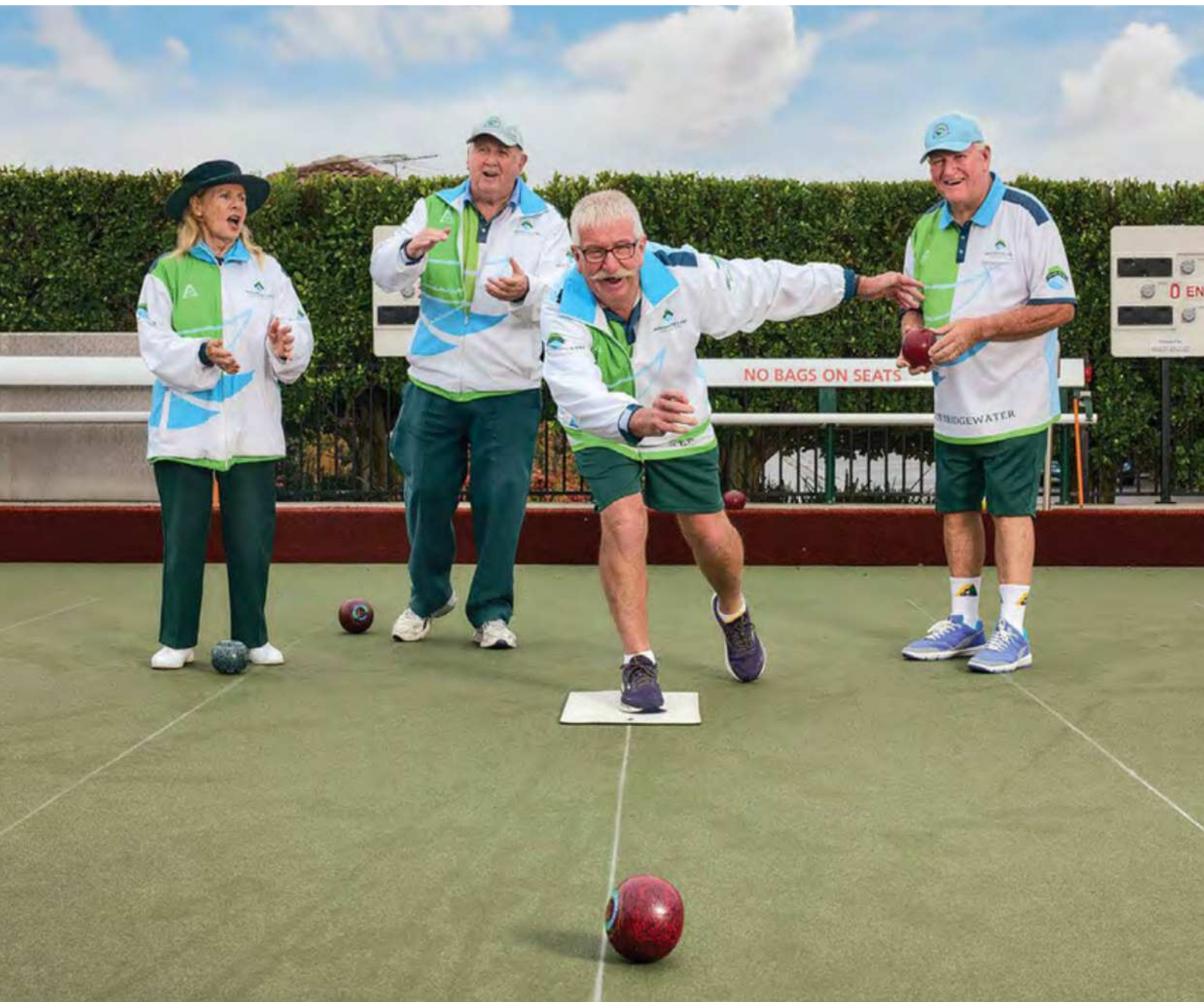
The local Bridgewater Lake Bowling team having fun playing bowls

The on-site Bridgewater Lake Bowls Club is more than just a sports facility – it's a place to share a laugh and enjoy a game in a relaxed and social environment.