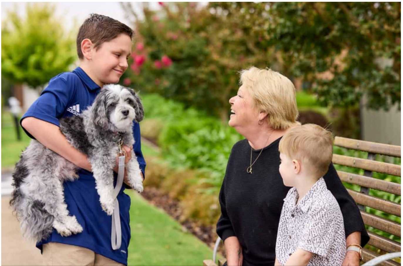
Bridgewater Lake resident enjoying time in the communal gardens with her grandchildren