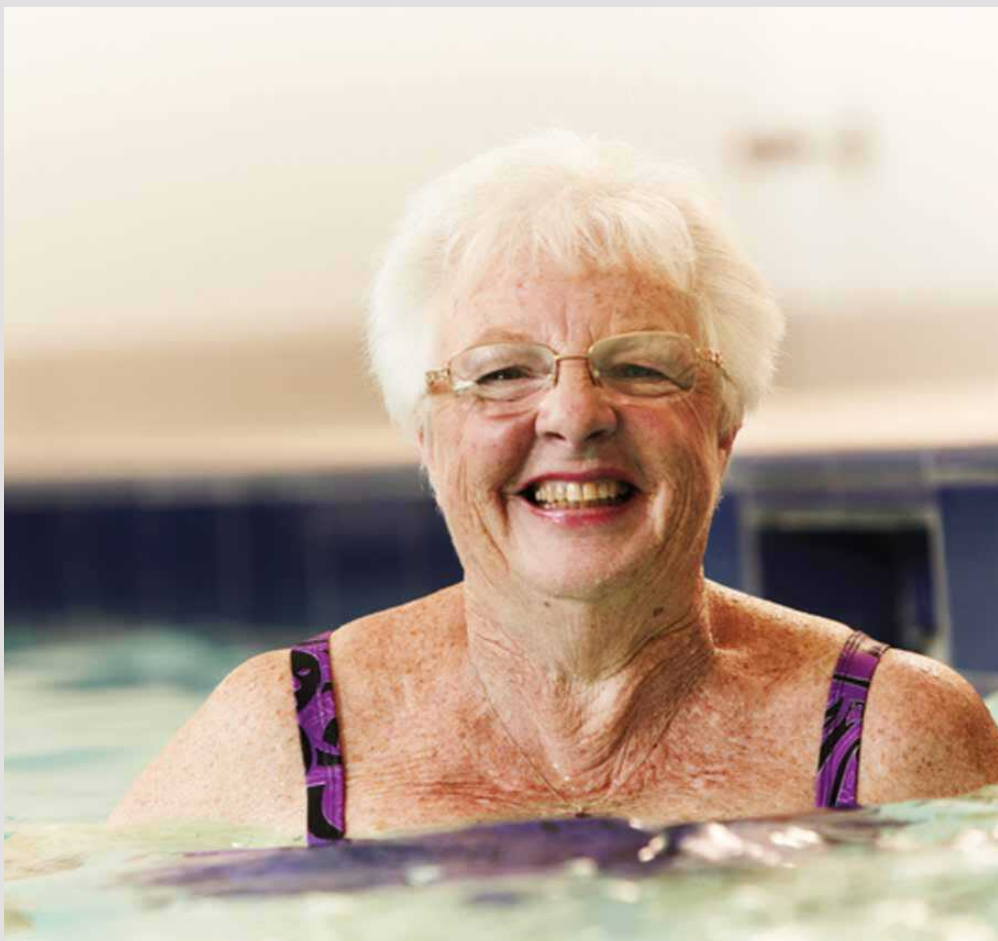
Bridgewater Lake resident enjoying their time in the heated pool

Our indoor heated pool and spa provide a comfortable and accessible space for residents to enjoy swimming, aqua aerobics, gentle exercise, or simple relaxation—all year round.