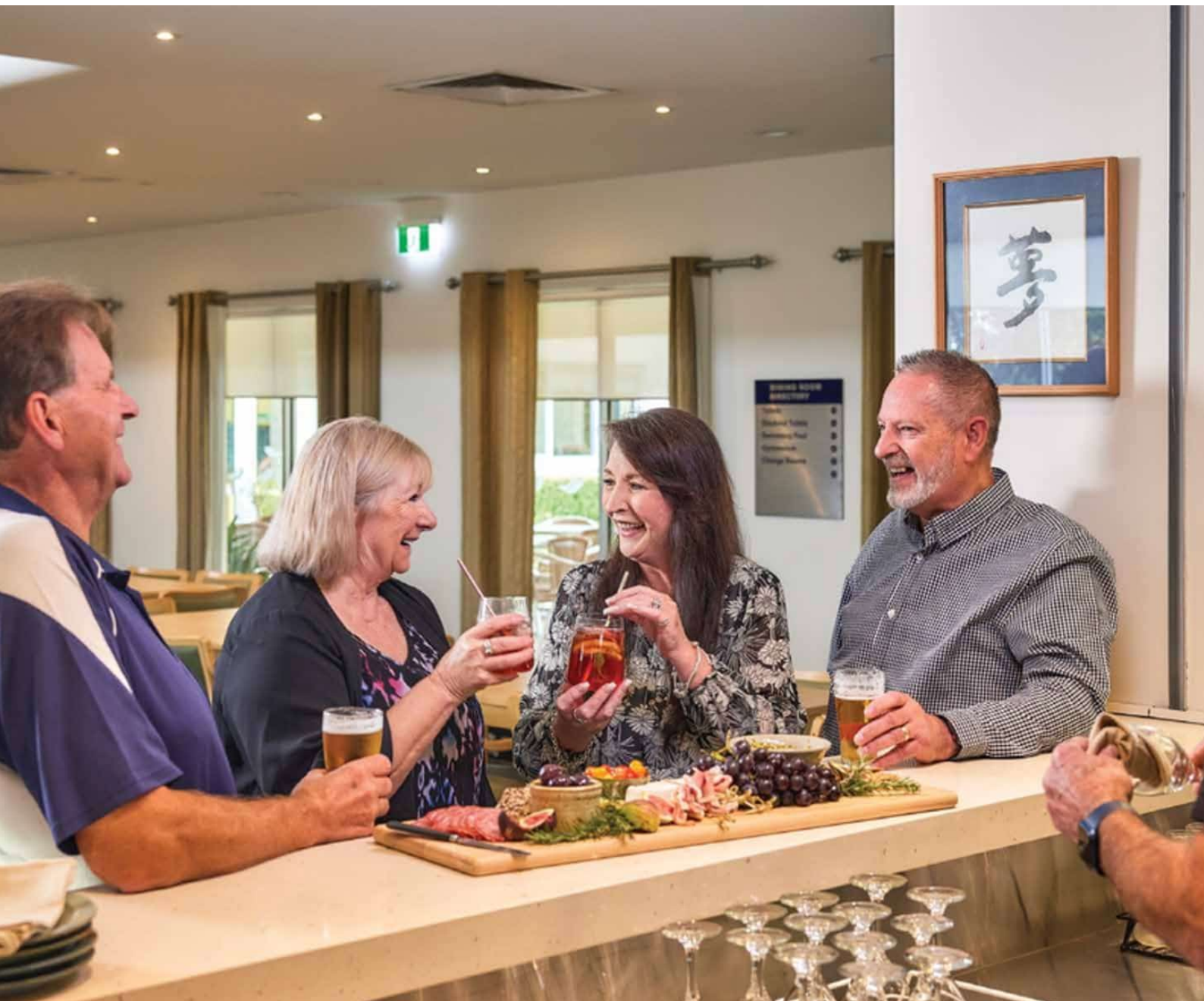
Residents enjoying themselves at Club Bridgewater Bar

Club Bridgewater is the social hub of Bridgewater Lake – it's a warm, welcoming and vibrant space where residents can come together to socialise relax and celebrate.