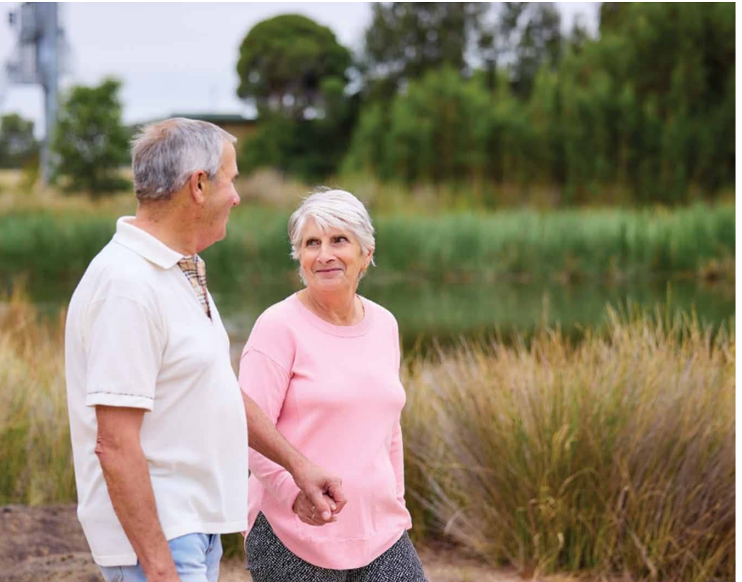
Bridgewater Lake residents enjoying a walk around the lake

The gardens and landscaped outdoor spaces are the true heart of Bridgewater Lake. More than just an aesthetic feature, these carefully designed green spaces promote well-being, relaxation, and a strong connection with nature.