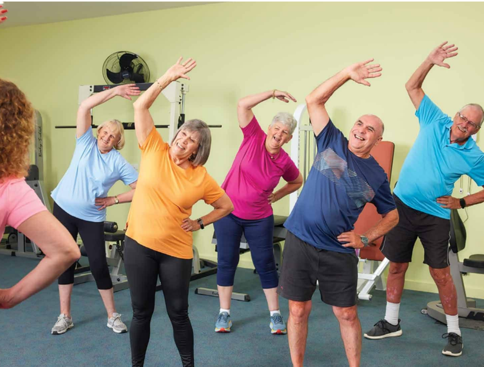
Bridgewater Lake residents enjoying a gym class

Our Gym & Wellness Centre offers a comfortable and well-equipped space for residents to maintain their health and fitness in a way that suits their needs and abilities.